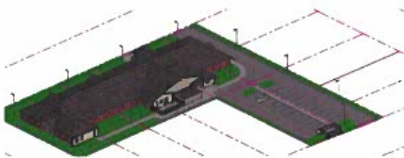
5 3D AERIAL - FRONT